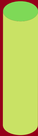
SCHOOLS AND PROGRAM OF SELECTED APPLICANTS